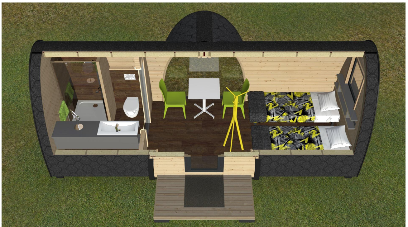
3D cut view